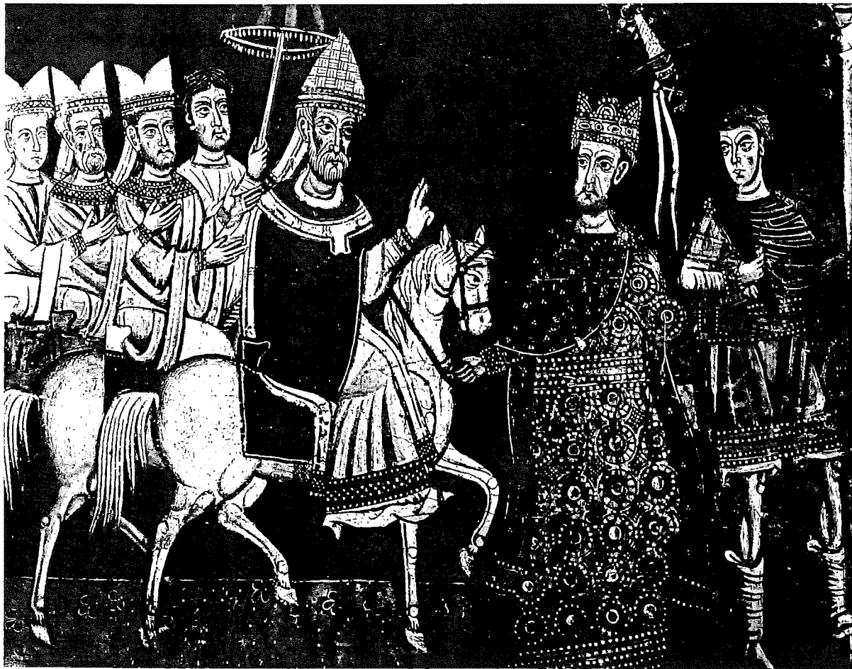
Wall painting showing Emperor Constantine (with crown) greeting the Pope (on horse)