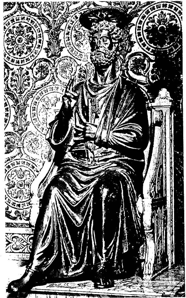
Sculpture of St. Peter, an early follower of Jesus Christ and the first pope of the Church of Rome

The early Roman emperors hated the Christians because Christians refused to worship the Roman gods, refused to support the Roman officials, and refused to serve in the Roman army. The Roman emperors made